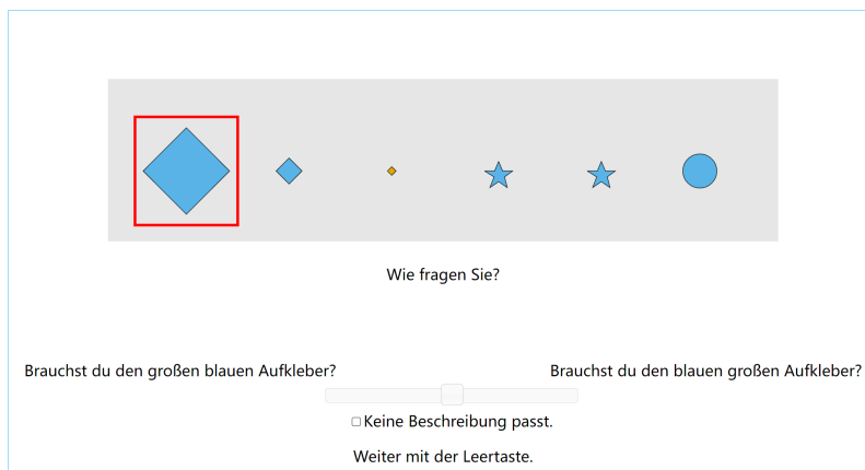
Figure 1: An example item from the current experiment in the condition with COMBINATION of dimension and color adjectives and RELEVANCE of the first property (i.e. dimension ) in a sharp SIZE DISTRIBUTION. A property was counted as relevant if it was necessary for referent identification. In this example size is relevant but color and shape are not. Glosses for the German linguistic material in the example item are provided in Appendix A.

for subjective-first orders should therefore be weakened in sharp SIZE DISTRIBUTION. The reason is that the SUBJECTIVITY hypothesis assumes that less subjective adjectives are integrated earlier into the hierarchical structure.