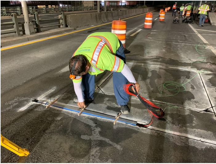
Installation of WIM System on Brooklyn-Queens Expressway

sensors were installed: two piezo-polymer (PVDF) sensors with one inductive loop were installed in each lane of the three-lane roadway in both directions (six lanes in total), while four piezo-quartz (Quartz) sensors with two inductive loops were installed on the right lane of the Queens-bound roadway where the majority of trucks travel. During installation, NYCDOT contractors provided needed lane closures for four nights to accommodate the installation effort, as well as a truck of known axle weights to calibrate the WIM sensors and system. Technical support was provided by C2SMART industry partner Kistler Instrument Corp., the manufacturer of the Quartz WIM sensors. With two types of WIM sensors with different accuracy levels in the same lane, the team is able to develop algorithms to calibrate for their differences while collecting and processing the WIM data.