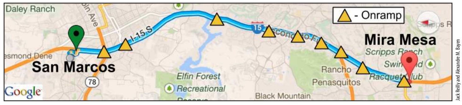
Freeway study site, Interstate 15 southbound in San Diego, CA.

Reilly tested his algorithms via computer simulation. The simulation model emulated traffic over a 20-mile stretch of southbound Interstate 15 in San Diego, California. Simulations were performed for a 170-minute period of a morning rush when traffic became congested. The freeway's traffic demands were forecasted over 25-minute horizons. Metering rates for the site's nine on-ramps and posted speed limits were reoptimized every 17 minutes. To satisfy the requirements of real-time operation, each optimization process was allowed to continue for no more than 10 minutes.