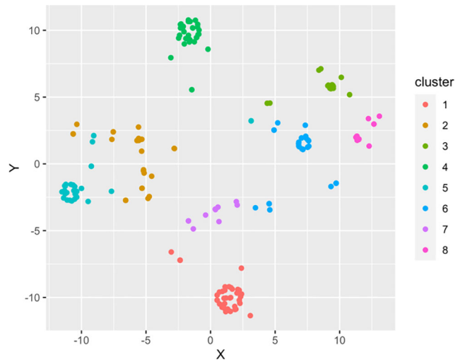
Figure 2. Viewing Gower clusters.