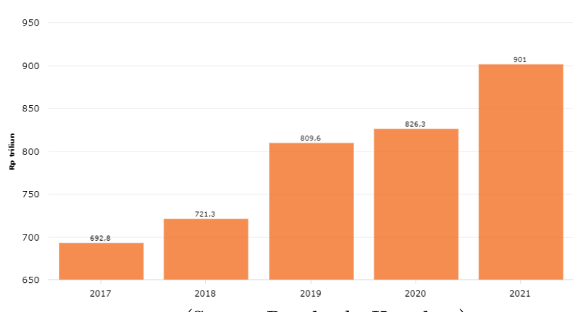
Figure 2. Graph of Indonesian Investment Growth 2017 – 2021

The trend of increasing investment does not only occur at the beginning of 2022. If you look at the statistics for the last 5 (five) years, there has been a growth of 6.9% annually in the period 2017 – 2021. In 2021, foreign investment is recorded to be one of the biggest contributors with a nominal value of 454 trillion rupiah (Dihni, 2022). These statistics are certainly proof that Indonesia is a country with considerable investment potential.