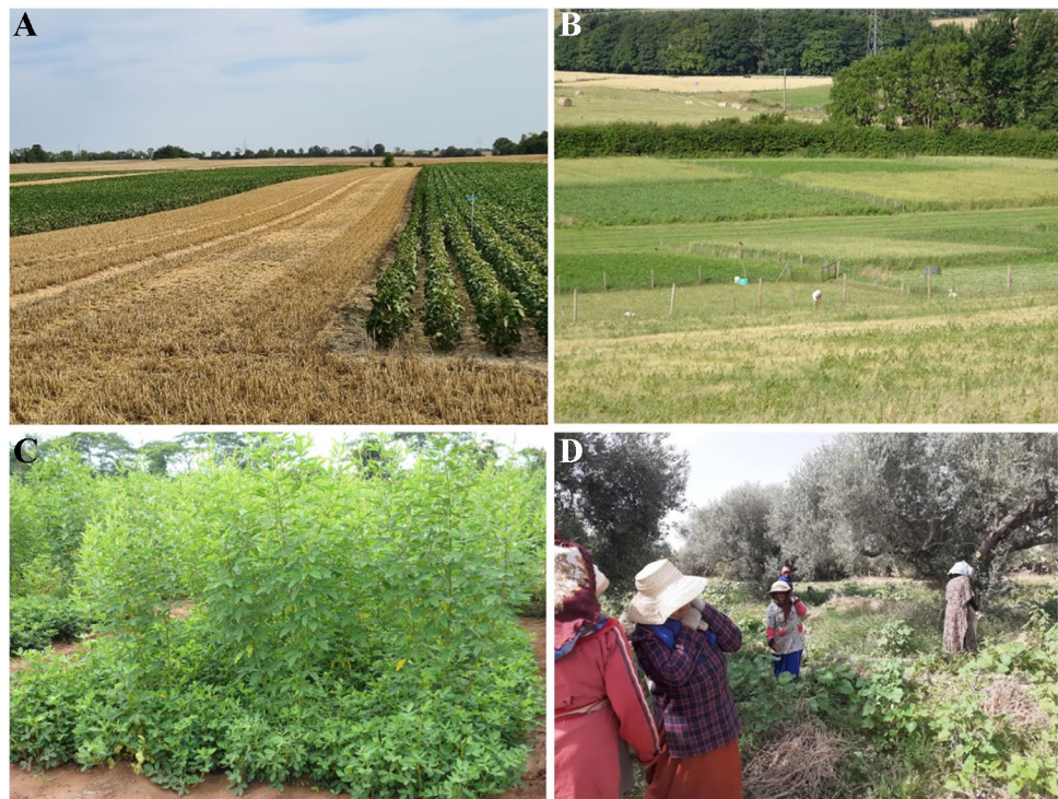
Figure 1 Diversification through soybean-wheat strip cropping in Germany (A), crop-livestock systems in Scotland (B), doubled-up legumes with pigeon pea and groundnut in Malawi (C), olive-water melon agroforestry systems in Tunisia (D).

Gou et al. (2022) identify diversified planting in arid irrigation areas to improve the sustainability of cropping systems using experiments in northwestern China. Reckling et al. (2022) analyze long-term field experiments from Sweden, Scotland, and France and find that diversification with