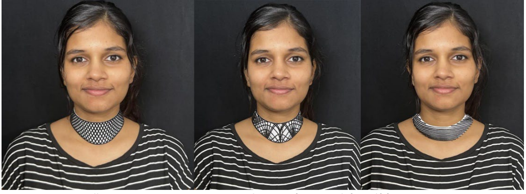
Figure 7 Completed neckless variants

properties, as well as to pattern geometry and design (Figure 7). The success or failure of the final composite relies on the right proportion of design intentions and respect to the natural material memory and behaviour. This would allow us to enhance Frei Otto's call for lighter, more energysaving, more mobile and more adaptable, in short, more natural buildings, or building components, such as roofs, ceilings, shading devices, tents, roofs and temporary shelters.