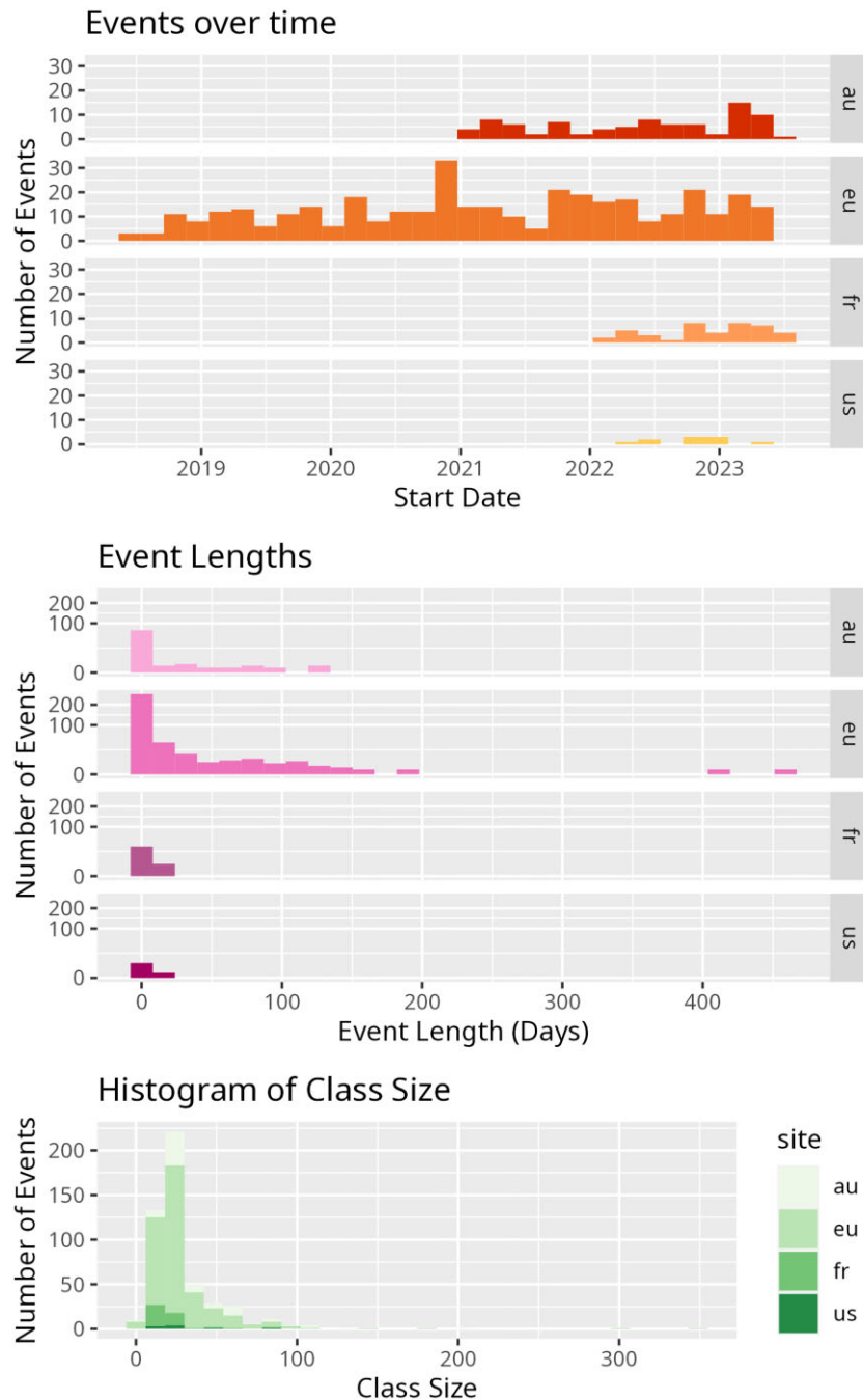
Figure 4: Since its introduction, it has grown into a well-used service over the past 4 years. There have been 438 training events, primarily hosted by the Australian and European servers, which are both very involved in training. Event length distribution in days is extremely heavily skewed to very short events, with a long tail of semester-long courses using the platform. Event sizes show a similar distribution; most classes are small, while 7 extremely large courses (>500 participants) were filtered from this graph as outliers. These courses are more like Massive Open Online Courses (MOOCs) than traditional in person courses.

resources may be allocated like the Galaxy Community Conferences, where the big 3 Galaxies configured TIaaS with considerable resources to permit local and remote synchronous training, all the way to semester-long courses, which may not necessitate a large allocation.