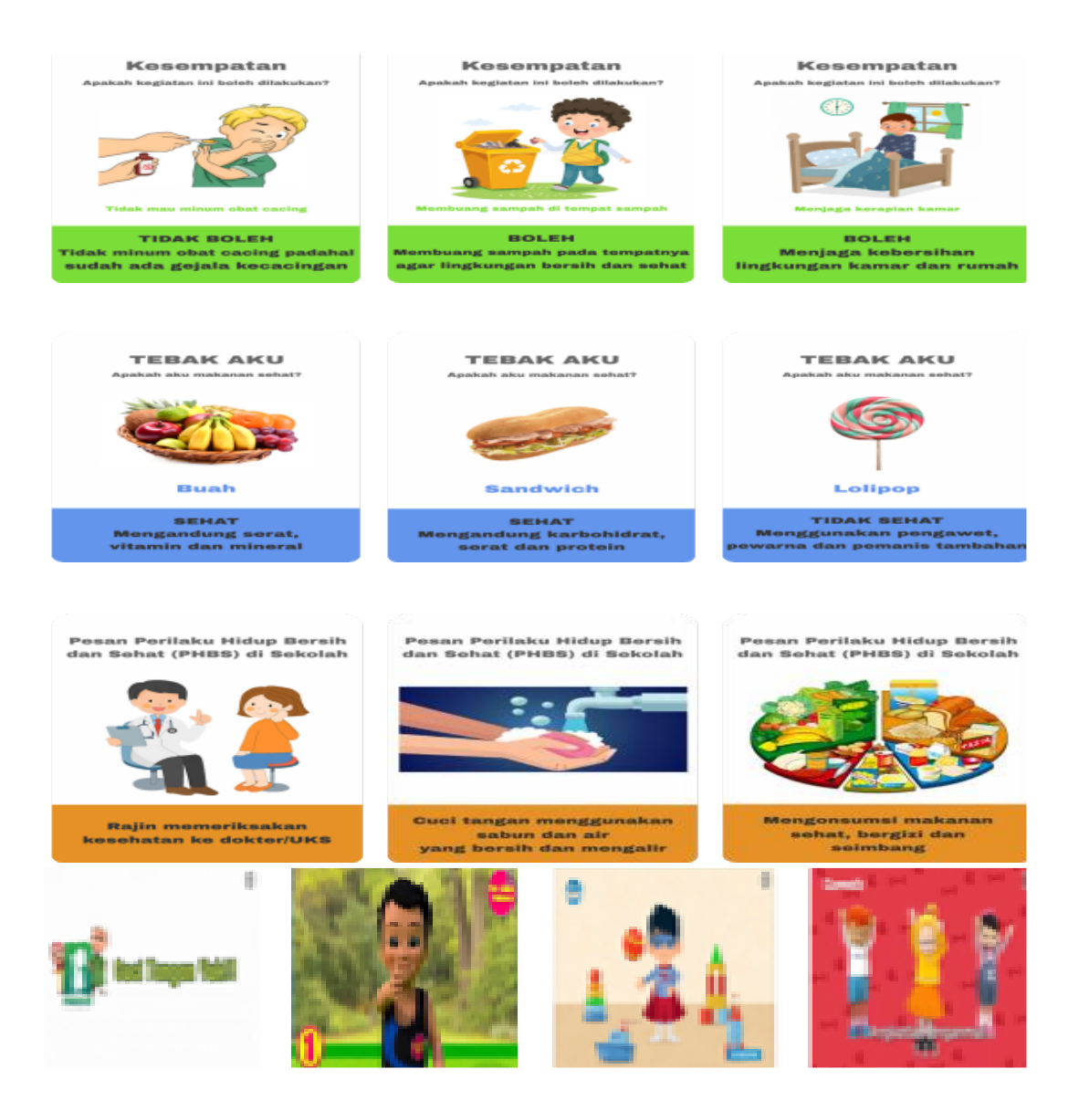
Figure.5. Block of "Kesempatan", Tebak Kartu, "PHBS", and "Istirahat sebentar yuk!"

The media expert validation test aims to determine the feasibility of the media used in the game covering 4 aspects, namely percentage design (6 indicators), interaction use (5 indicators), accessibility (6 indicators), and reuse (2 indicators). Calculation results show a high score so it was concluded that the application media was very worthy. Qualitatively, some inputs and suggestions for improvement from the media expert team were: