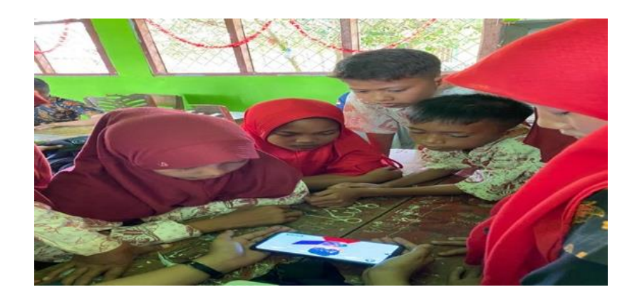
Figure.5. Small group trials

Furthermore, the results of t-paired test can be seen in the table below.