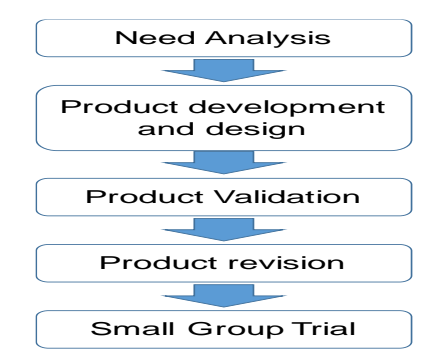
Figure.1. Stages of Product Development Procedure

The research design was R&D (Research and Development) as a process approach to develop a certain product with five stages of procedures, namely needs analysis, product design development, product validation, product revision, and product trial<sup>10</sup>.