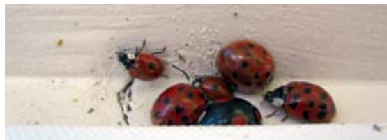
Harlequin ladybirds overwintering in the author's house alongside native 2-spot ladybirds.

In the winter time, window frames and attics often harbour large groups of harlequin ladybirds and also 2-spot ladybirds. You could send in photos of the ladybirds you see in your house or school this winter. How many harlequins are residing in your house? How many 2-spots?