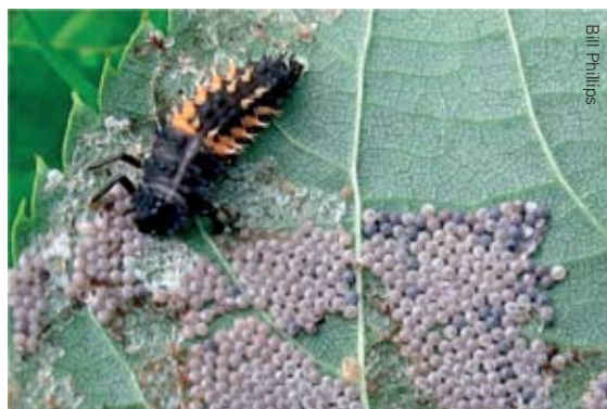
A harlequin ladybird larva eating eggs of noctuid moths.

We know that this species has the potential to threaten native biodiversity because we have carried out lots of laboratory experiments which show that the harlequin ladybird will eat many different types of insect, from other ladybirds to butterflies.