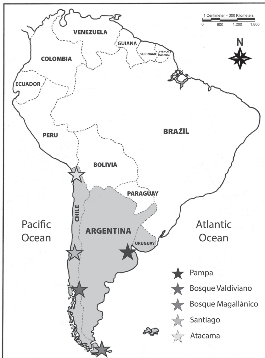
Figure 2. Map of the Southern Cone of South America (shaded area), showing the biogeographic provinces (Morrone 2001) where studies on aquatic fungi (stars) were recorded. Additionally, the taxa reported in each provinces biogeographic were indicated in Table SII.

followed by 109 Ingoldian and only 17 to aero-aquatic fungi. These Ingoldian fungi represent 32 % of the known species worldwide. This suggests the need of more studies on this aquatic fungal group, since it is known that they play a key role in litter decomposition (Gessner & Chauvet 1994, Graça & Ferreira 1995, Gulis & Suberkropp 2003) and as pollution bioindicators in freshwater ecosystems (Solé et al. 2008, Dubey 2016, Tarda et al. 2019). In addition, molecular studies have shown that Ingoldian fungi are