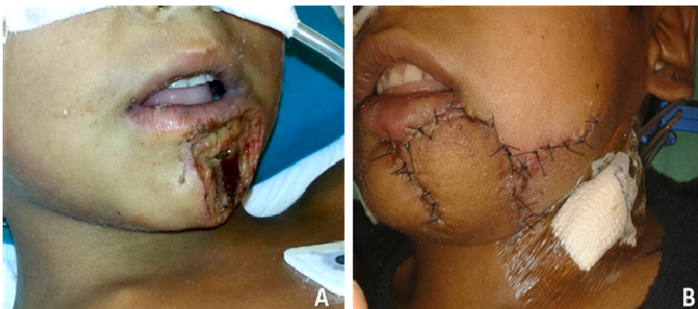
Fig. 1. A) Necrotic ulcer on the chin showing communication to oral mucosa and mandible exposure. B) Grafting and suturing performed 17 days after admission, under treatment with liposomal amphotericin B.

The genus Lichtheimia belongs to the family Lichtheimiaceae , in the fungal order Mucorales but taxonomy of the members of this genus has been changed in the last decades. Today, based on morphological, physiological and molecular data, six species have been described in this genus: L. corymbifera , L. ornata , L. ramosa , L. hyalospora , L. sphaerocystis and L. brasiliensis , of which only L. corymbifera and L. ramosa are considered clinically relevant [5,18]. A study performed by Woo et al. [19] showed that a significant proportion of infections caused by L. corymbifera (ex Absidia corymbifera ) was, in fact, L. ramosa infections