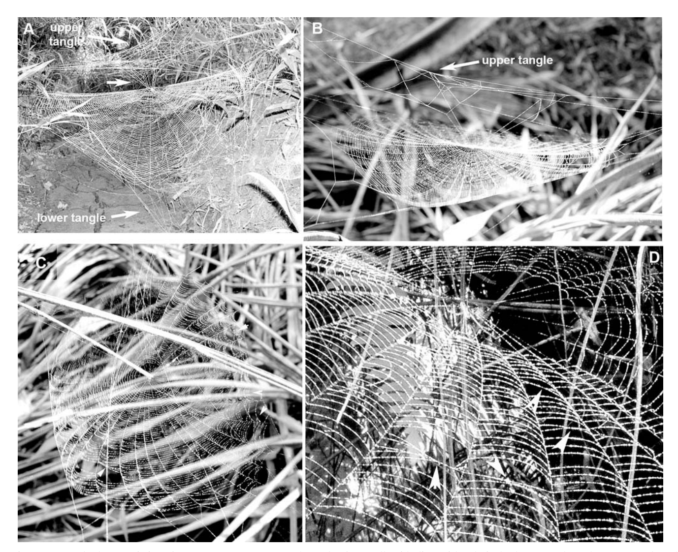
Figure 1.—Web characteristics of young Leucauge argyra . A. Web of a small spiderling with relatively dense tangle and numerous threads connecting the tangle to the hub of the orb web below. Part of the lower tangle with some threads attached to the substrate below is shown. B. Web of an older instar spiderling with a reduced tangle and few threads connecting the tangle to the hub of the orb web below. C. Web with radii and spiral threads deformed by a weak breeze in the field. D. Section of a spiderling web showing some spiral threads collapsed (white arrows).

Webs of L. argyra show clear ontogenetic changes. Adult females spin typical orb webs in horizontal planes (0-20^{\circ}) without additional silk structures. They build them in open spaces, using exposed twigs and leaves on the herbaceous layer to attach the anchor threads. In contrast, early instar spiderlings (first instar out of the egg sac, recognized by their whitish abdomens, to possibly fourth instars, based on size) spin tangle structures above the horizontal orb webs (Figs. 1A, B). The tangle varies from a relatively dense, narrow tangle, to a few threads just a few mm above the orb. Several threads connect the hub to the tangle above. The tangle above the orb seems to be denser in younger spiderlings (Fig. 1A). In some webs, there is also a tangle of sparse threads that connect the web frame with the substrate below (Fig. 1A). Webs of early instars are constructed within dense herbaceous vegetation, often occupying small spaces among grass leaves.