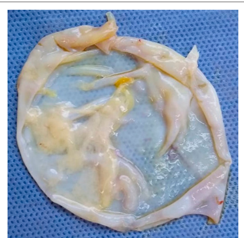
Figure 4. Germinative membrane of hydatid cyst: whitish laminar fragment measuring 9.5 \times 2.5 \text{ cm}

Patients may be asymptomatic for many years, until the size of hydatid cysts causes clinical signs