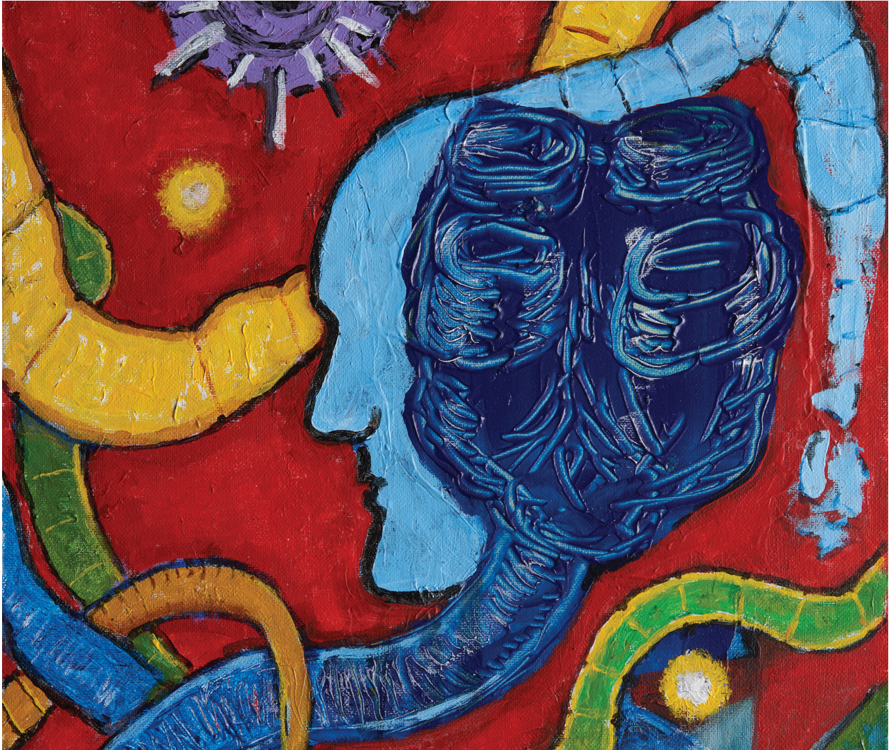
William C. Campbell (1930–), Tapeworm Enigma , 2020 (detail). Acrylic with supplemental gel on canvas, 14 in x 18 in/35.6 cm x 45.7 cm. Personal Collection, Tom and Bev Kennedy, Waunakee, Wisconsin, USA.