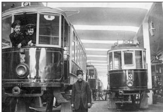
Fig. 9 Kharkiv tram, 1910 ( http://surl.li/euidu )