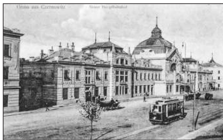
Fig. 5. The two-track tram line near the new Chernivtsi railway station, 1910 ( http://surl.li/euidt )

On July 16, 1906, tram traffic from Pavlovska Square to Petinska Street near Balashovsky Station was opened in Kharkiv (Fig. 6). Oleksandr Pohorelko defended the need for further development of the tram network in the city.