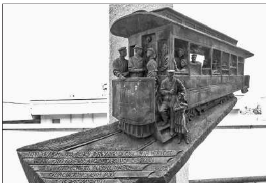
Fig. 14 The monument to the first Ukrainian electric tram

The construction of tram connections was a significant and important event for the cities because the first tram routes were directed to railway stations. Despite