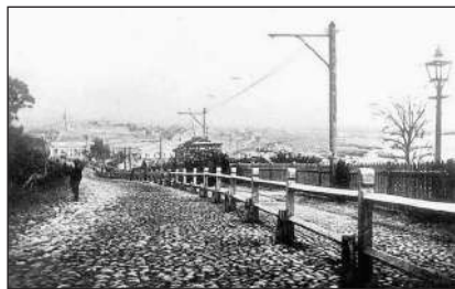
Fig. 2. Oleksandr's Descent, 1892

traction with steam will allow overcoming the steep ascent from Podil Street to Khreshchatyk.