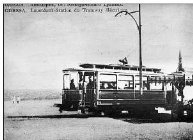
Fig. 11 Tram, Odesa — Lustdorf, 1910 ( http://surl.li/euiea )

The need to create a tram service in the city of Vinnytsia was considered in 1898, but the implementation took place only in 1913. In October, with the support of the Kyiv branch of the Russian company «General Electricity Company» was built a city railway, 8.6 km long and 1 m wide 1 .