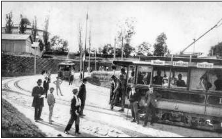
Fig. 3 Lviv 1894, tram line «Station — Exhibition» (left),