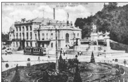
Fig. 1. Tsar's Square, 1892 ( http://surl.li/euidl )