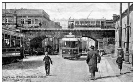
Fig. 10 Odesa tram ( http://surl.li/euidz )