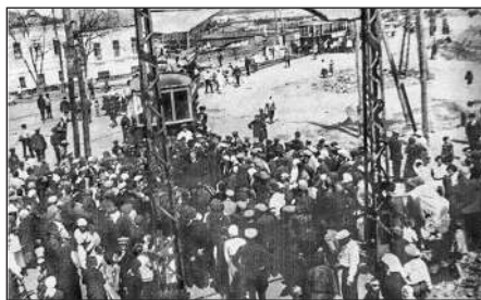
Fig. 12. Opening of the first tram line in Mariupol, 1933 ( http://surl.li/euiej )