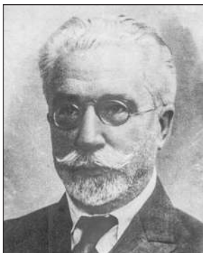
Fig. 8 Professor Pavlo Kopniaiev (funds of the historical museum of NTU «KhPI»)