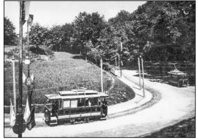
modern I. Franko Street (right) ( http://surl.li/euidp )

place. These first carriages were made in Austria (Graz). In 1893, Yosyf Tomytskyi moved to Lviv, where he supervised the construction of the first DC power plant and tram infrastructure (Fig. 3).