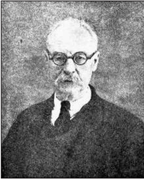
Fig. 13 Professor Oleksandr Potebnia (funds of the historical museum of NTU «KhPI»)