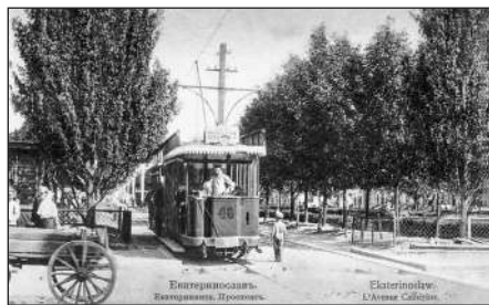
Fig. 4 Belgian tram on Yekaterininsky Avenue, Katerinoslav ( http://surl.li/euidq )

Rolling stock for the first tram lines came from Germany, Belgium, and Austria (Rudakevich, I. & Sochuvka, A. 2019).