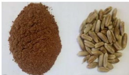
Fig 2. Grinded date kernel.

The sample collection is carried out in the region of Mraguen, one of the ksours of the municipality of Adrar which is located north of the city of Adrar.