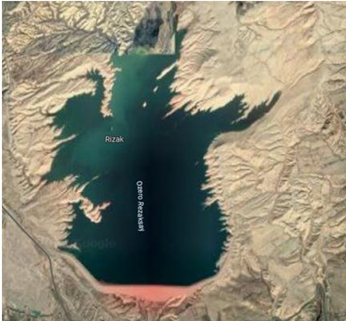
Fig. 1. Rezaksoi reservoir

agricultural irrigation. It is a run-of-river reservoir that regulates the seasonal water flow of the Rezaksoy River. The dam of the Rezaksoi reservoir is a stone-earth dam with two structures capable of supplying 40 m 3 /s of water to the Syrdarya and Northern Fergana canals and facilitating water discharge. The maximum length of the dam's surface is 3200 m, with a maximum design storage (MDS) of 80 m and a full capacity of 200 million m 3 . The wind wavelength in the western direction is 2200 m, with an average wind speed ( W ) of 10 m/s [5].