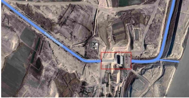
Fig. 1. Satellite image of the Amu-zang channel

The total length of the Amu-zang Canal is 56.6 km, and the maximum water consumption is 120 \text{ m}^3/\text{sec} . The cross-section along the length of the channel is trapezoidal (according to the project), 44.9 km of which is earthen, and 11.8 km is concrete. The annual water flow period is 10 months; from February to November, the channel works in full mode, and the total flow is 9091,000 to be used for irrigation purposes. Field research was conducted in the Amu-Zang main channel's PK 30 and PK 35. In the studies, it was observed that the water consumption in the canal changes during the season, which leads to changes in other hydraulic dimensions of the canal (Fig. 2).