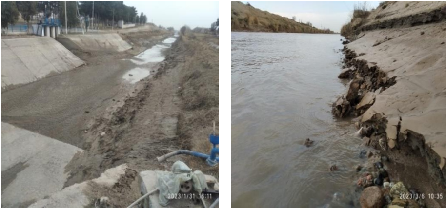
Fig. 2. Deformation processes in pickets PK 30-35 of Amu-Zang channel

The total length of the Amu-zang Canal is 56.6 km, and the maximum water consumption is 120 \text{ m}^3/\text{sec} . The cross-section along the length of the channel is trapezoidal (according to the project), 44.9 km of which is earthen, and 11.8 km is concrete. The annual water flow period is 10 months; from February to November, the channel works in full mode, and the total flow is 9091,000 to be used for irrigation purposes. Field research was conducted in the Amu-Zang main channel's PK 30 and PK 35. In the studies, it was observed that the water consumption in the canal changes during the season, which leads to changes in other hydraulic dimensions of the canal (Fig. 2).