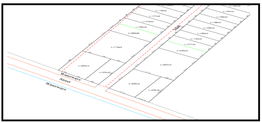
Figure 2. Example of Ground Splitting Process for Housing

Relinquishment of rights is the termination of a legal relationship between a plot of land and its owner, which is carried out through deliberation and accompanied by the provision of appropriate compensation. The relinquishment of rights is then recorded in a deed/statement of relinquishment of right. This land relinquishment can only be carried out based on an agreement between the entitled parties regarding the technique as well as the amount and form of compensation to be given.<sup>14</sup> According to Arie S. Hutagalung, the reliance of land rights is carried out if the subject who needs land does not meet the requirements to become the holder of the required land rights so that it cannot be obtained by buying and selling and the land rights holder is willing to relinquish his land rights.<sup>15</sup>