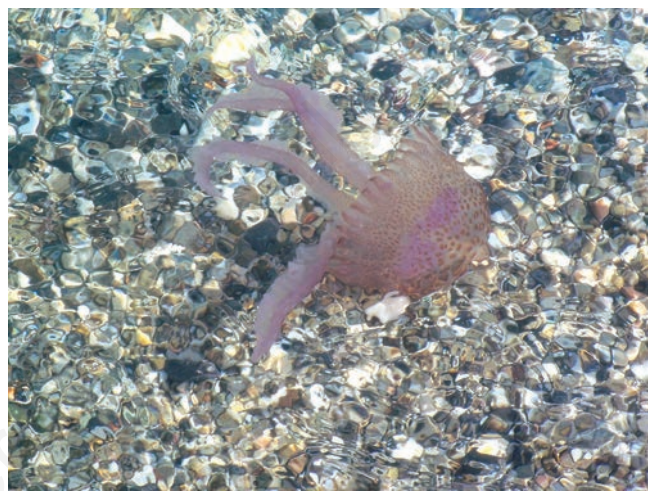
Figure 1. Pelagia noctiluca (Cnidaria: Schyphozoa) photographed in June 2012 along the Eastern Sicily coast.

Furthermore, nematocyte activation and the discharge in situ of Pelagia noctiluca nematocyte was stated to be a Ca^{2+} dependent phenomenon, 19 as previously observed in other cnidarians, such as Calliactis parasitica and Aiptasia mutabilis . 20,21 Notably, Ca^{2+} permeable mechanosensitive channels were demonstrated to be involved in the activation of nematocytes 19 and Ca^{2+} ions were indicated to act preventing the discharge of isolated nematocysts. 14