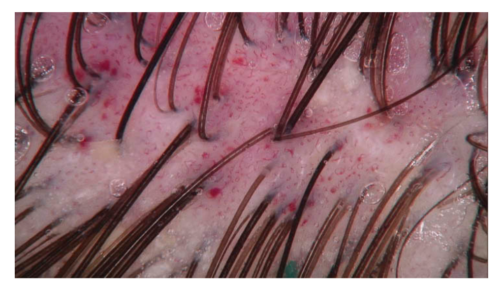
Figure 2. Tricoscopy (70× magnification) of SP: homogeneously distributed dilated tortuous capillaries with bushy appearance and small hemorrhages (SP pattern).

In general, cosmetic and pharmaceutical products for treating SD include keratolytics (such as sulfur or salicylic acid), regulators of sebum production (such as zinc or tar), antifungal drugs (such as selenium sulfide or azole drugs) and/or antimicrobial natural products (such as tea tree oil or