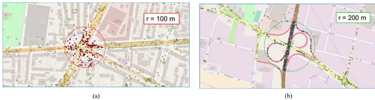
Figure 2 Two examples of different diameter options for the matching between nodes and positioning data: a two lanes road (a) and a motorway case (b).