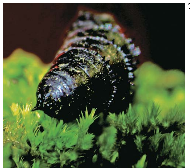
Figs 2-7 – 2 , Information board at main entrance of Grotticelle Nature Reserve (Basilicata); 3 , edge of a forest habitat, Grotticelle Nature Reserve; 4 , larva of Brahmaea ( Acanthobrahmaea ) europaea Hartig, 1963 feeding on Fraxinus angustifolia subsp. oxycarpa (Willd.); 5 , mature larva of B. europaea about to pupate (top), and pupa soon after formation (bottom); 6 , hardened and darkened pupa of B. europaea a few hours after formation (ventral view); 7 , detail of pupal cremaster of B. europaea and three rows of stout spines on segments A5-A7 (dorsal view).