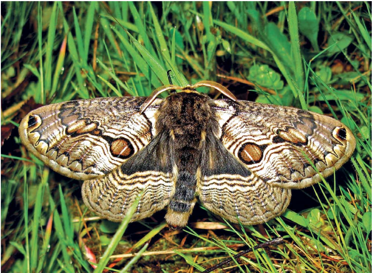
Fig. 1 – Adult of Brahmaea (Acanthobrahmaea) europaea (Grotticelle Nature Reserve).

Main diagnostic characters of Acanthobrahmaea Sauter, 1967 involve peculiarities of wing veins and the pupa (Sauter 1967, 1986; Rougeot 1971), as this bears rows of stout spines on dorsum of abdominal segments A5-A7 (Fig. 7), and no other related species are known to possess such structures (see e.g. De Freina 1985 for the unarmed pupa of the allied B. ledereri ).