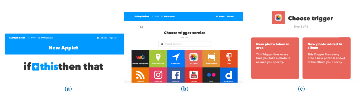
FIGURE 2. Some screenshots of the user interface used in the empirical evaluation. The interface resembles IFTTT and allows the composition of trigger-action rules with both the IFTTT version and the EUDoptimizer enhanced version. In the IFTTT terminology, rules are named applets, while technologies are named services. (a) New rule page. (b) Trigger technology selection step. (c) Trigger selection step.

<sup>5</sup>https://angularjs.org/ last visited on February 12, 2018