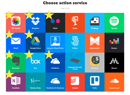
FIGURE 4. Optimized grid layout for actions calculated with SA when the selected trigger technology is iOS Photo (10,000 iterations). Stars indicate the most frequently used technologies: 9 out of 10 are at the top of the grid layout.

of the grid layout. Furthermore, there are logical groups of related technologies that allow the definition of similar functionality, e.g., One Note , Nimbus Note , and Evernote .