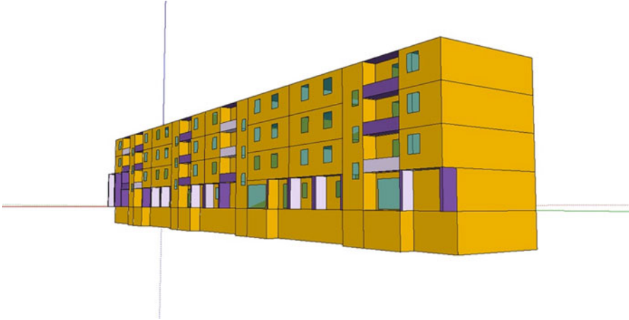
Fig. 40.3 Building drawing in T3D plugin for SketchUp

The core building model is the Trnsys Type 56 (multizone building model, with thermally coupled zones). The model reads and processes the TRY weather data through the Trnsys Type 15-3. Moreover, the model describes the ground thermal properties using Trnsys Type 77.