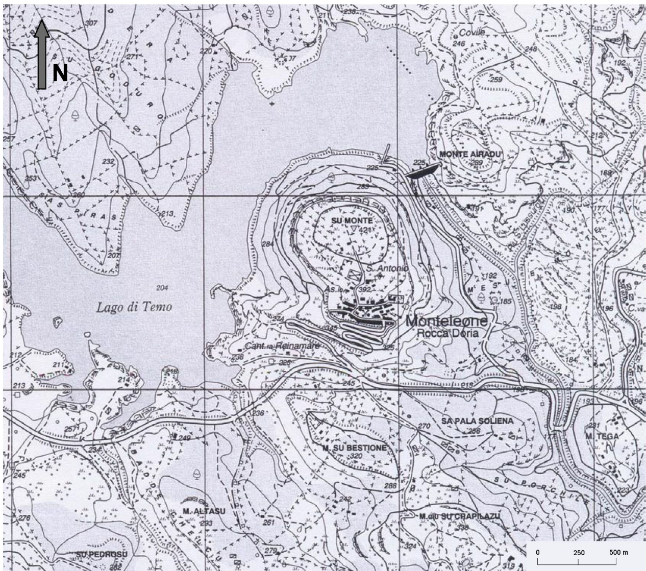
Fig. 2: Monte Leone Rocca Doria