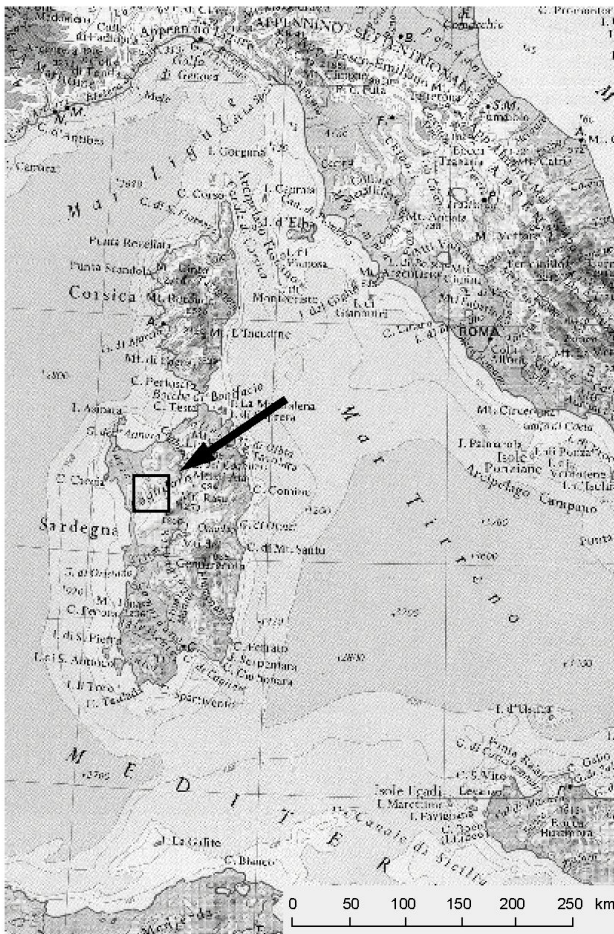
Fig. 1: Location of the study area Lage des untersuchten Gebietes Situation de la zone d'étude