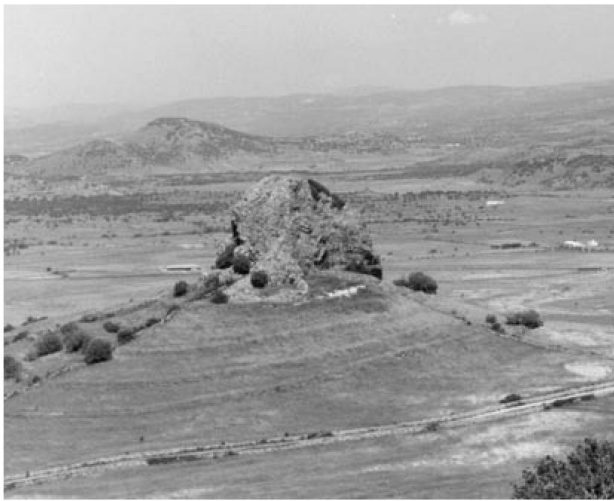
Photo 1: The neck of Pedra Mendarza, linked to Plio-Quaternary volcanism, in the surroundings of Monteleone Rocca Doria

Die Spitze des aus einer vulkanischen Phase im Plio-Quartär stammenden Pedra Mendarza, in der Umgebung von Monteleone Rocca Doria