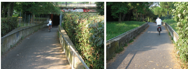
Fig. 6. entry and exit lanes of subway of the railway area

Much attention, moreover, should be address to the subway of the railway area, because its exit lane is characterized by a high longitudinal grade (8%), difficult to overcome for cyclists and, in particular, for disabled peoples (figure 6).