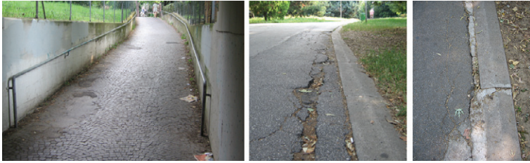
Fig. 7. poor maintenance conditions of the block pavement and near bike lane shoulders

Since pavement damages can greatly influence road safety and in particular the cyclist's handling, potholes and patches must be repaired quickly using correct method. The patching material must be level with the adjoining pavement and the frictional conditions must be very similar.