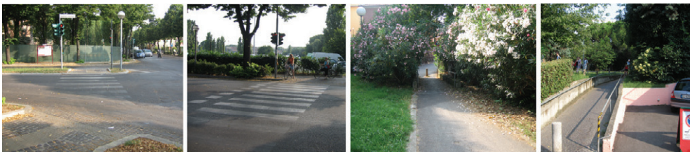
Fig.8. road markings in poor maintenance conditions and poor visibility in bike lane accesses

Many of the numerous bike lane accesses, moreover, are characterized by a poor visibility caused by obstacles located in sight zones, such trees or vegetation (figure 8). Since this is an important contributing factor in bicycle crossroads accidents, it is necessary to eliminate these lateral elements, which impair driver's field of vision.