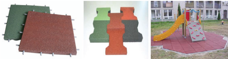
Fig. 9. safety flooring systems

The examined bike lane is characterized by numerous amenities which build a sense of place and enhance the environment for pedestrians as well as cyclists. They include features such as benches, shade structures, bicycle parking, place to rest, route map signage, trash cans, water fountains and numerous playgrounds for children. In the playground areas it is advisable to install safety flooring systems consist of rubber flooring that cushions effectively the impact with the ground in case of falls (figure 9). According to the EN 1177 European certification tiles are made of recycled rubber granules bonded by special binders and they are available in different sizes, colors and thicknesses. They are self-laying and self-fixing through the use of joint pins. Panels can be laid directly on a sub-base of draining material, such as sand or fine gravel, provided it is well leveled and compacted.