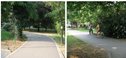
Fig. 5. curves characterized by small radii and poor sight distances

Much attention, moreover, should be address to the subway of the railway area, because its exit lane is characterized by a high longitudinal grade (8%), difficult to overcome for cyclists and, in particular, for disabled peoples (figure 6).