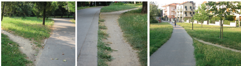
Fig. 4. pedestrian itineraries out of bike lane inside park

The accurate analysis of the bike lane geometry points out that its lane width is narrow to contain traffic flow moving on it, especially during summer. This problem is confirmed by the level of service values resulted from CSD analysis, equal to E and F, and by the fact that users tend to follow personalized itineraries, going out the bike lane and moving inside the park toward desired destinations, in order to reduce the distance between the old town and the car parking located in the neighborhood (figure 4). In this way rises a vertical gap between the bike path and the adjacent lawn, very dangerous for cyclists in transit, from which dirt and debris are thrown on the road surface with a dramatic decrease of skid resistance. These are important contributing factors in crossroad accidents for cyclists, because they can cause them to lose control. In these conditions specific protective measures should be taken in order to qualify the bike lane building and paving these new itineraries, selecting correct materials that must be level with the adjoining pavement and the frictional conditions must be very similar.