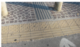
Fig. 10. tactile paving for blind and vision impaired pedestrians

Along the “inside” zone, from XX settembre street to Roma one, moreover, the pavement of the examined bike lane is characterized by a tactile paving edge, with a yellow textured surface to assist blind and vision impaired pedestrians (figure 10). Tactile warnings provide a distinctive surface pattern of "truncated domes" or cones, detectable by long cane or underfoot, which are used to alert people with vision impairments. It is being hoped that this is be installed in the whole bike lane.