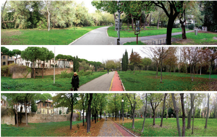
Fig. 2. the bike lane object of study