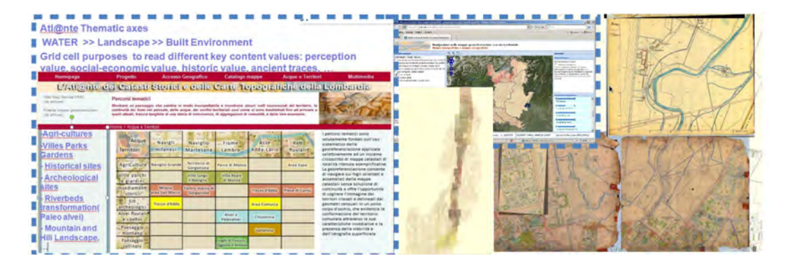
Figure 1: Atl@s web geoportal and the landscape area test along thematic axe of the Lambro river

need a block of images taken from different points of view at suitable scales and baselines. The integration with GNSS/INS [3,4,6] sensors allowed to obtain satisfying results, at the landscape scale. Camera calibration and image orientation have reached a high level in term of automation [8]. In the case nadiral images, the use uncontrolled flight path under the condition of well-targeted ground control points (GCP) enable the application of algorithms for automatic orientation. Research on fully automatic UAV image-based sensor orientation [8] opens opportunities in contexts like water view fronts devoted to metric image processing and information extraction. Moving the point of view, the GCP detection for the complex schema image block become difficult, especially in the case of very low cost uncontrolled flight, that ask to develop orientation and 3D modelling from markerless images [11] considering the wide spread potential of similar applications. Controlled sensor systems could be matched with the results obtained by multiple views 3D texturized models in the Computer Vision domain (Acute3D, http://acute3d.com/) in order to obtain technical instrument for line-of-sight analysis.