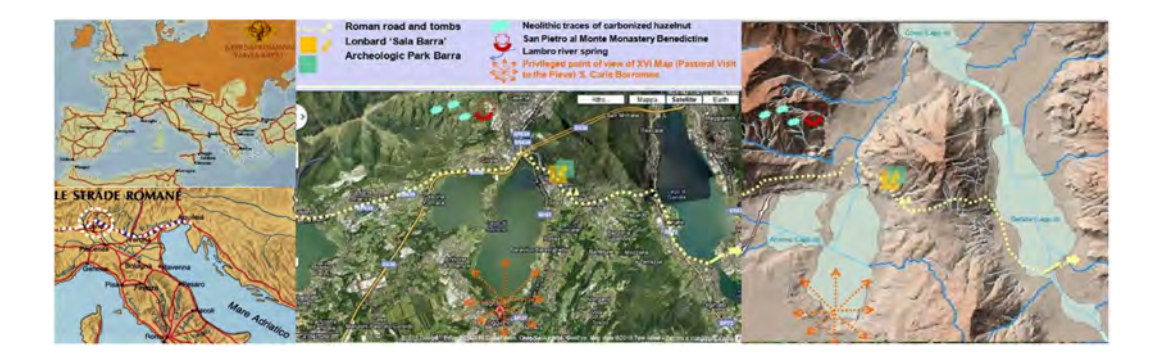
Figure 2: The sample landscape area, on the Lake of Annone closed to the access to the Lake of Como, is placed along an important node of the roman road from Aquileia to the North Europe. The principal stakeholder stratified landscape element are signalized.