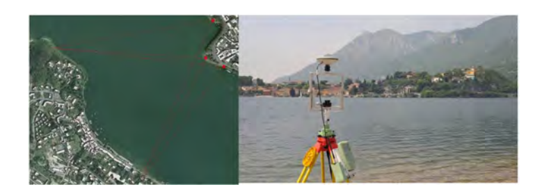
Figure 6: (Left) Test site, in red different standpoints and the lines-of-sight. (Right) 'Photo-GPS' system during the acquisition of images.