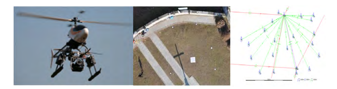
Figure 4: The UAV system, an image of the area and the scheme of theodolite/GPS measurements.