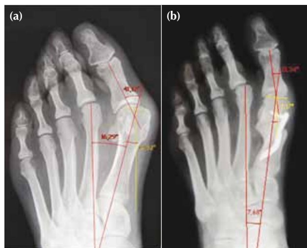
Figure 2 In a patient with moderate hallux valgus: (a) the first metatarsal is shorter than the second metatarsal before surgery. (b) After distal oblique metatarsal osteotomy and fixation by the Endolog system, the first metatarsal is shortened. A linear osteotomy and a percutaneous lateral soft tissue release should be more appropriate.