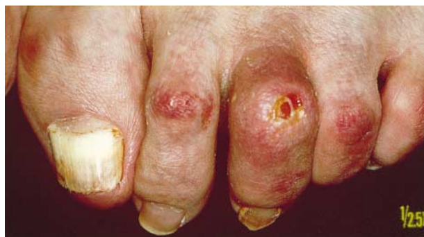
Fig. 1. Trichophyton soudanense onychomycosis of the great toenail. The nail plate is opaque and milky-white in colour.

The patients (1 male and 2 females, aged 65–69 years) were immunocompetent Caucasians affected by a toenail onychomycosis associated with tinea pedis due to T. soudanense . The affected nails showed a