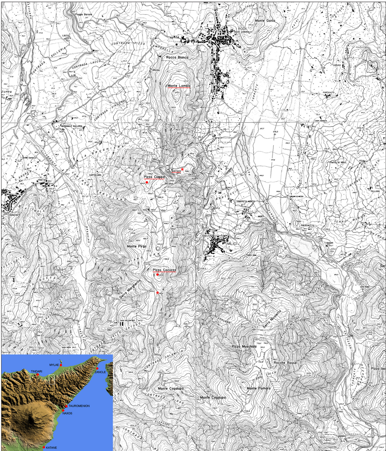
Fig. 1. General map of the investigated area: the fortifications on Monte Ciappa and Pizzo Cocuzza and the two necropolises (asterisks) to the north and south are highlighted. In the square, DEM shows the location of the study area.

Despite the very fragmented archaeological research conducted along the Tyrrhenian slopes of the Peloritani Mountains, the territory of Rodi-Milici, west of the Patri river, which runs alongside the villages to the east, has considerable potential information for the reconstruction of the dynam-