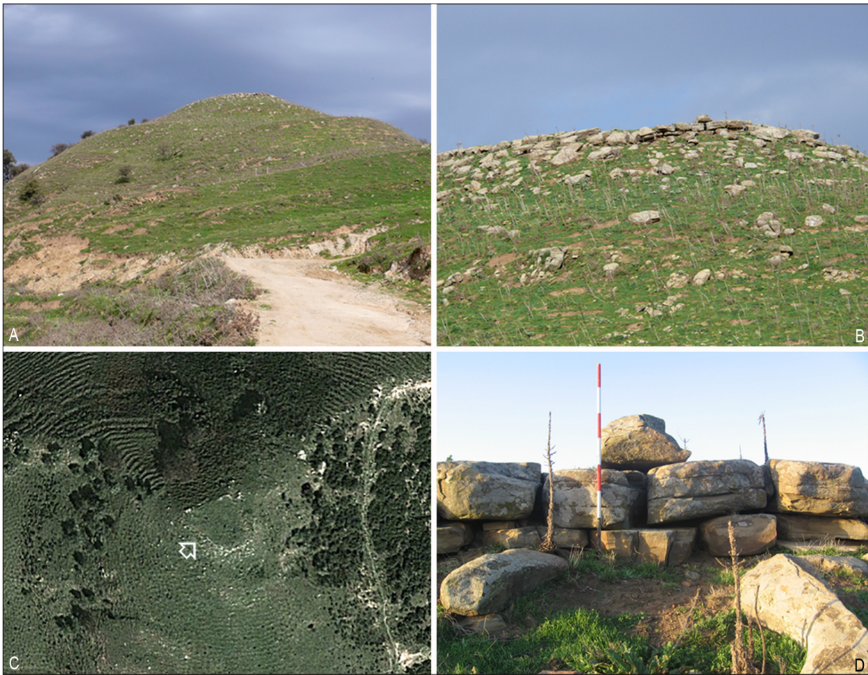
Fig. 3. The fortification on Pizzo Cocuzza: A, general view from south; B, top of the hill; C, vertical view from a WorldView-2 satellite image (1-4-2012); D, detail of the preserved wall.