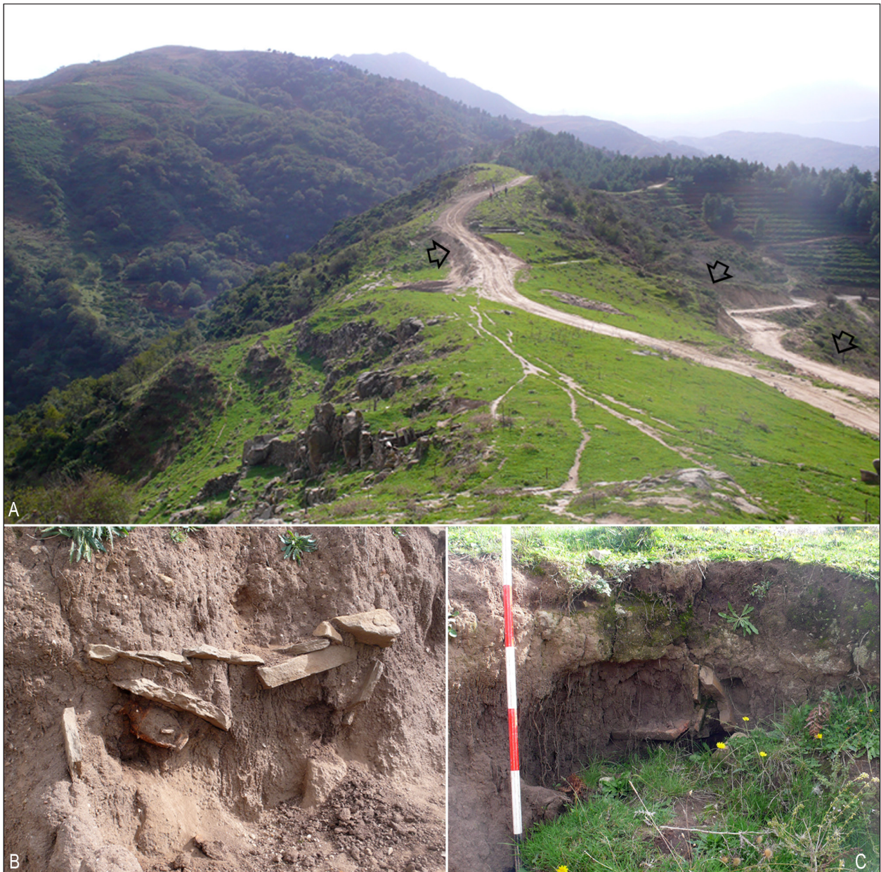
Fig. 5. Necropolis to the south of Pizzo Cocuzza: A) general view from north (the arrows indicate the location of the tombs), B-C) details of two pit graves cut by recent mechanised works.

The research has also highlighted that the necropolises were located outside the plateau, to the north-east and to the south of the two fortified hills. The first funerary area is in the site named Mustaco, a small plain (about m 290 AMSL) at the