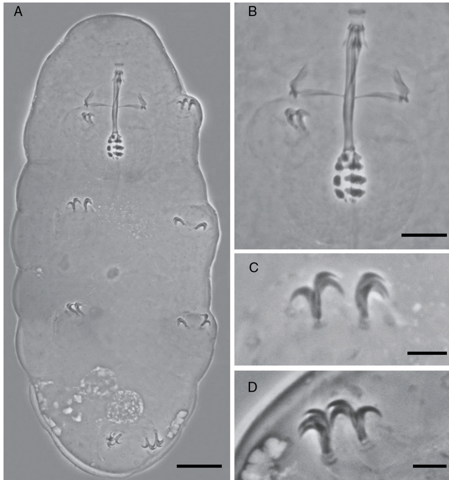
Figure 1. Holotype of Minibiotus pentannulatus sp. nov. (A) Habitus (scale bar 20 \mu\text{m} ). (B) Detail of the buccal tube (scale bar 10 \mu\text{m} ). (C) Detail of the claws of the second pair of legs (scale bar 5 \mu\text{m} ). (D) Detail of the claws of the fourth pair of legs (scale bar 5 \mu\text{m} ).

well-developed ventral lamina 13.1 \mu\text{m} [47.5]. Stylet support inserted on the buccal tube at 15.9 \mu\text{m} [57.6]. Rounded pharyngeal bulb 32.29 \mu\text{m} , with triangular apophyses close to the first row of macroplacoids. Three rows of macroplacoids decreasing in size, with granular appearance and a row of small microplacoids. First macroplacoid 3.0 \mu\text{m} [10.9], second macroplacoid 2.5 \mu\text{m} [9.1], third macroplacoid 2.1 \mu\text{m} [7.6]. Microplacoid, 0.9 \mu\text{m} [3.3]. Macroplacoid row is 8.0 \mu\text{m} [29.0], entire placoid row is 9.2 \mu\text{m} .