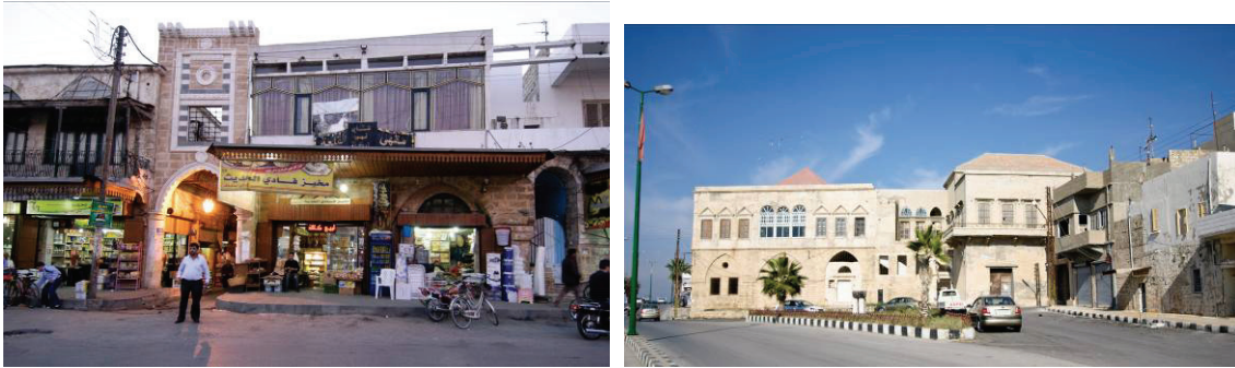
Fig. 1. (a) gateway to the main souk; (b) a very important khan near the waterfront

However it is important to stress that best practices should be specific for each analyzed reality and not be applied at different spatial contexts at the same time. Also it is essential that every best practice should be able to respond simultaneously to three different dimensions of sustainability, environmental, economic and social, and not just one aspect.