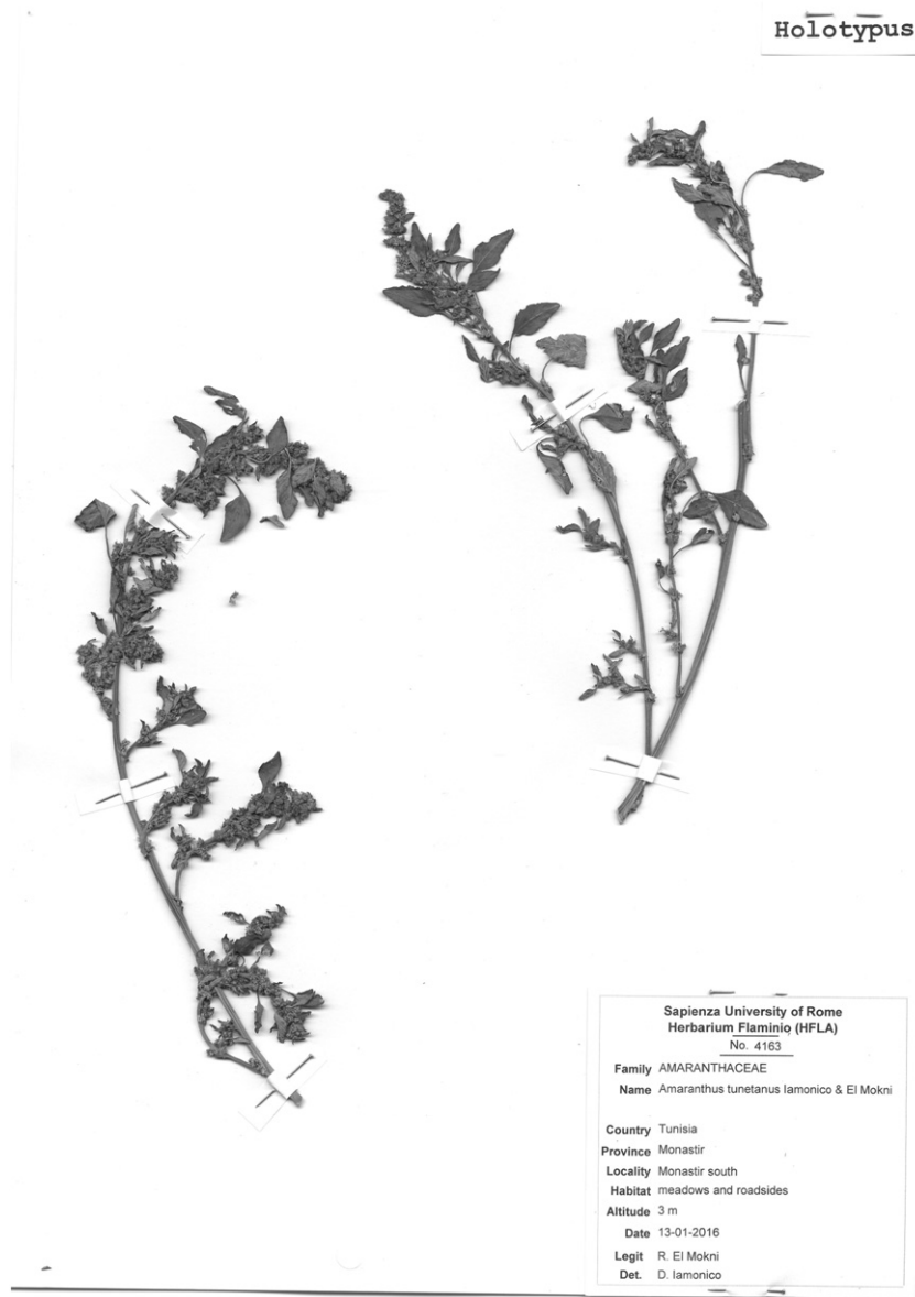
Fig. 1. Holotype of Amaranthus tunetanus (HFLA-4163!).

green in the first half of the blade and red in the distal part), ovate, rhomboidal, (0.5-1.0-2.2(-2.5) \times (0.2-0.5-1.0(-1.6) cm, glabrous, margins entire or slightly undulate, sometimes reddish, apex obtuse with apical mucro, base cuneate, petiolate; petiole (0.1-0.3-2.5 cm long], with prominent white veins on the abaxial surface. Synflorescences in either axillary glomerules or a single terminal spike in the same individual; the terminal synflorescence is erect, dense or interrupted, green. Floral bracts 1, usually light green, ovate, (1.7-2.0-2.5(-2.7) \times (2.3-2.5-3.0(-3.2) mm, about half the length of the perianth, apex acuminate-mucronate, margin entire, glabrous. Staminate flowers with 5 tepals, about equal to each other, lanceolate, 3.0-4.0(-4.5) \times 1.0-1.3 mm, apex acute, mostly awned; stamens 5. Pistillate flowers with 5 tepals [ 2.7-3.0-5.5(-5.7) \times 2.3-2.5 mm], connate in the proximal 1/4-1/3 , spatulate with the distal part expanded, hyaline distally (veins of tepals not occurring in the hyaline part), and an apical mucro up to 0.4 mm long, median vein sometimes red in color; style branches more or less erect; stigmas 2(-3) . Fruit indehiscent, brown, subglobose to ellipsoidal, (1.5-3.0 \times 1.0-2.5 mm), slightly longer than the perianth, and verrucose at maturity. Seed lenticular, 0.9-1.0(-1.1) mm in