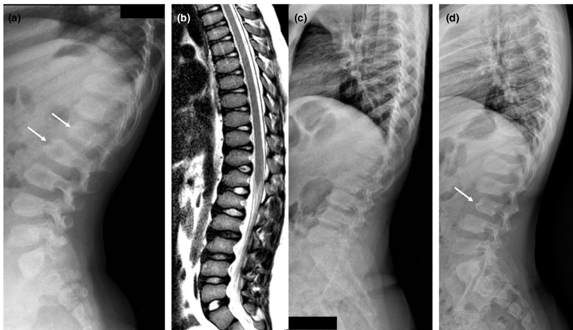
FIGURE 1 Spinal X-ray and MRI features of the patients. (a) Spinal X-ray, lateral view, of patient #1 performed at 6 years showing platyspondyly with anterior vertebral beaking from D11 to L4, more evident in L1 and L2 (arrows). (b) Spinal MRI, T2-weighted sagittal image, and (c) Spinal X-ray, lateral view, of patient #2 performed at 15 years of age demonstrates diffuse platyspondyly with mild anterior wedging of the lumbar vertebrae. (d) Spinal X-ray, lateral view, of patient #3 performed at 9 years of age reveals diffuse platyspondyly with mild anterior wedging of the lumbar vertebrae, more evident in L3 (arrow)

At the age of 10 years and 5 months, the clinical picture and neurological examination were stable. Brain MRI showed mild progression of cerebral atrophy with enlargement of the lateral ventricles (Figure 2D'–F'). Therapy with Miglustat was started (age 10 years and 5 months) at the dosage of 100 mg three times a day, gradually increased to 200 mg three times a day. She initially presented occasional diarrhea and mild abdominal pain, spontaneously improving in the following weeks. In the first 4 months of therapy, her