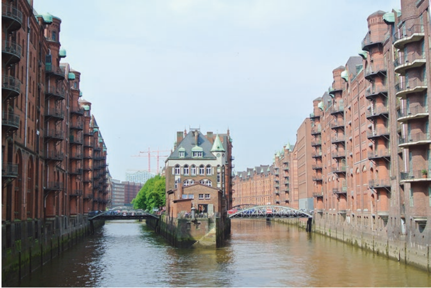
Image 3.1 View on the warehouse district ( Speicherstadt ) from the Poggenmühlenbrücke. (June 2013, author’s photo)

showroom of more than 250m 2 . Inside, piles of pile carpets, plain and elaborately decorated, sober and colorful, sorted by size and pattern, lie stacked on the floor of the old rustic stock house. The smell of wool reminds me of the small carpet shop I knew in my childhood, run by an Iranian in the town where I grew up. Rahim tells me that most of the company’s customers are Europeans; Iranians usually import carpets through private travel. We sit down at a table in front of an open door looking at the canal that runs directly behind the house (Image 3.3).