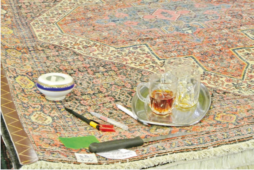
Image 3.4 Tea set from Iran on a hand-knotted Persian carpet. (June 2013,)

he is a member of the two most important Hamburg-based Iranian professional associations, AICE and BIU (Union of Iranian Entrepreneurs).