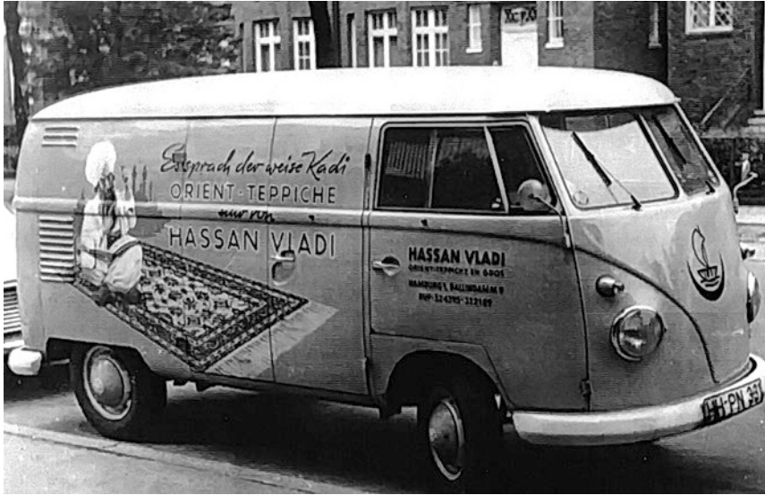
Image 3.6 Utility vehicle of the merchant business Hassan Vladi, probably the 1950s (Parviz' family archives)

downward social mobility (Khosravi 1999; Moallem 2000). The merchants' collective agency was sustained by their relatively small numbers, a common bazari background in Iran, and their participation in a system of reputation in which mutual trust and control relied on multiplex 14 and crosscutting relations.