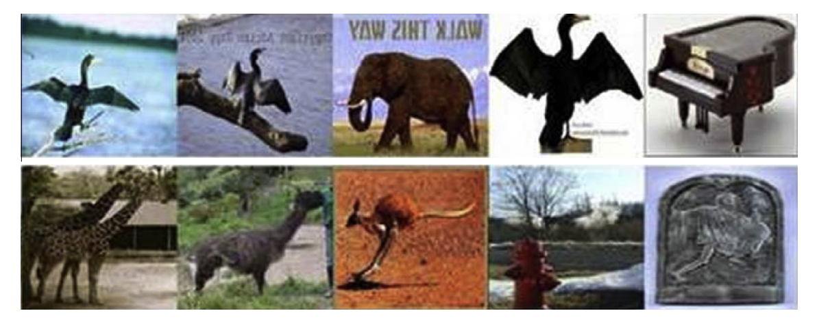
Figure 3 Samples from the Caltech dataset.

The first experiment, reported in Tables 1–3, was aimed at comparing variants of the steps in our proposed approach.