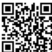
Edorium Journals: On Web

We welcome you to interact with us, share with us, join us and of course publish with us.