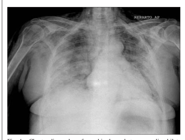
Fig. 4. - Chest radiograph performed in the end-stage revealing bilateral interstitial opacities.

Although organising pneumonia is uncommon, it should be included in the differential diagnosis in any patient with bilateral airspace disease that is unresponsive to antibiotics [2]. Post-infectious OP can develop after a variety of infectious pneumonias, including agents such as Streptococcus pneumoniae [9], Chlamydia [10], Legionella [11] and Mycoplasma pneumoniae [12] and viruses such as human immunodeficiency virus [13] and Parainfluenza virus [14]. Parasitic infection including Plasmodium vivax [15] and fungal infection, including Cryptococcus neoformans [16] and Pneumocystis Jieroveci [17], have also been reported as a cause of OP. BAL may be used to exclude other causes of OP, particularly infections [18]. In our case, BAL was negative for micro-organisms, although viral culture was not carried out.