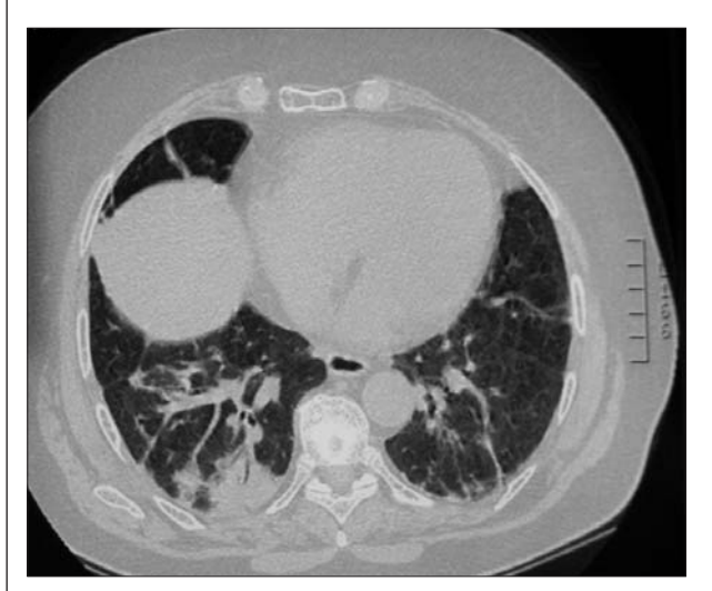
Fig. 1. - HRCT scan of the chest demonstrating an alveolar consolidation, pleural-based, with air bronchogram of the posterior segment of the right lower lobe, there was also a smaller, adjacent, nodular-like opacity.

Since the observations were not conclusive for a definite diagnosis, the patient underwent open lung biopsy. Histopathological examination re-