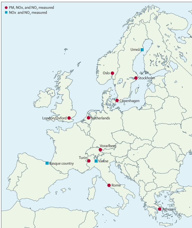
Figure 1: Areas where cohort members lived, measurements were taken, and land-use regression models for prediction of air pollution were developed NO x =nitrogen dioxide. NO x =nitrogen oxides (the sum of nitric oxide and nitrogen dioxide). PM=particulate matter.

Air pollution concentrations at the baseline residential addresses of study participants were estimated by land-use regression models in a three-step, standardised