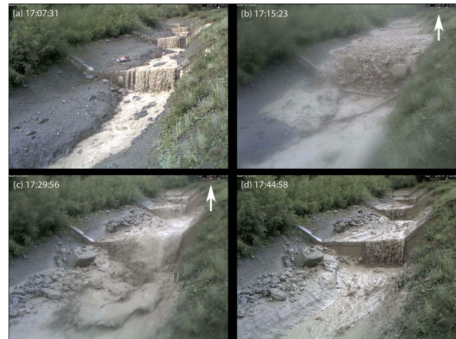
Figure 3. Frames from the video camera part of the EWS testing field (Fig. 2b) showing the debris flow occurred on 15 July 2014 in the Gatria creek. Time in the upper-left corner of each frame is in UTC+1 (local time). The closure algorithm correctly turned off the flashing light at the end of the process: (a) the creek before the process (flashing light off); (b) arrival of the main front (flashing light on, as pointed out by the white arrow); (c) a secondary surge (flashing light still on); (d) the end of the process (flashing light off).

Within the 51 days of tests carried out during the 2014 summer season, two false alarms were detected by the system. One was likely produced by the passage of a vehicle along the track located on the left bank of the torrent (Fig. 1) and the other by a distant source of vibration that caused simultaneous recordings at the three sensors. The relative data were recorded by the monitoring equipment. The recorded video of the July debris flow event and the monitoring data concerning the false alarms have provided precious information regarding the performances of the algorithm. The latter will be consequently improved to reach better performances and reduce the number of false alarms. The improvements are currently under development and an improved version of the algorithm is actually under test. Moreover, another monitoring equipment composed by one geophone and an infra-