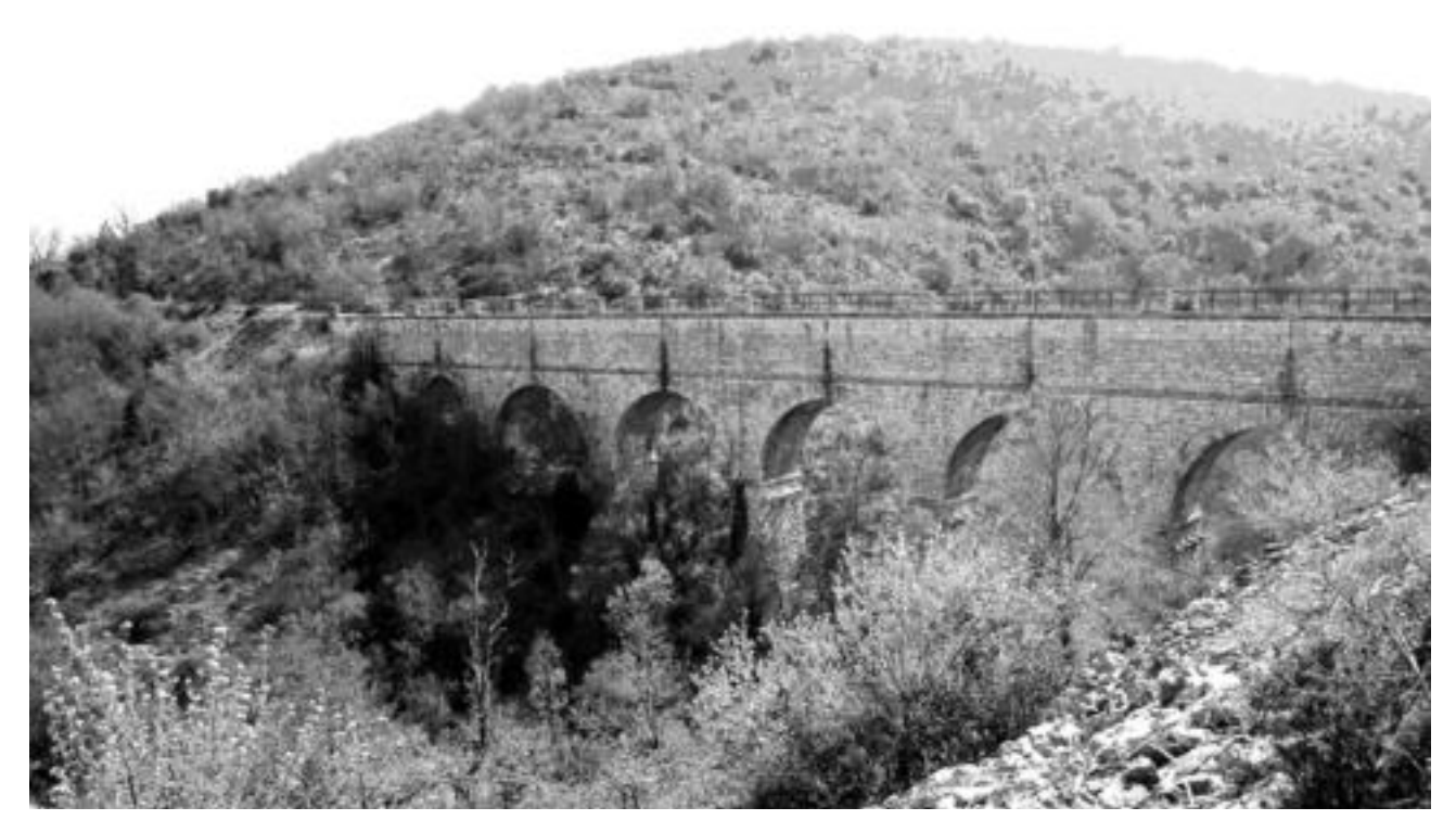
Fig. 2 - Greenway through a bridge and a canal along the Acquedotto Pugliese. (picture from "vie verdi" greenways in Puglia).

With reference to the financed interventions [Agenda 21 Locale; Progetti Interreg; Gal; etc.], it emerged that those like the greenways of Pavia, Sicily and Pordenone, are among the most consistent with the accredited definitions of a greenway.