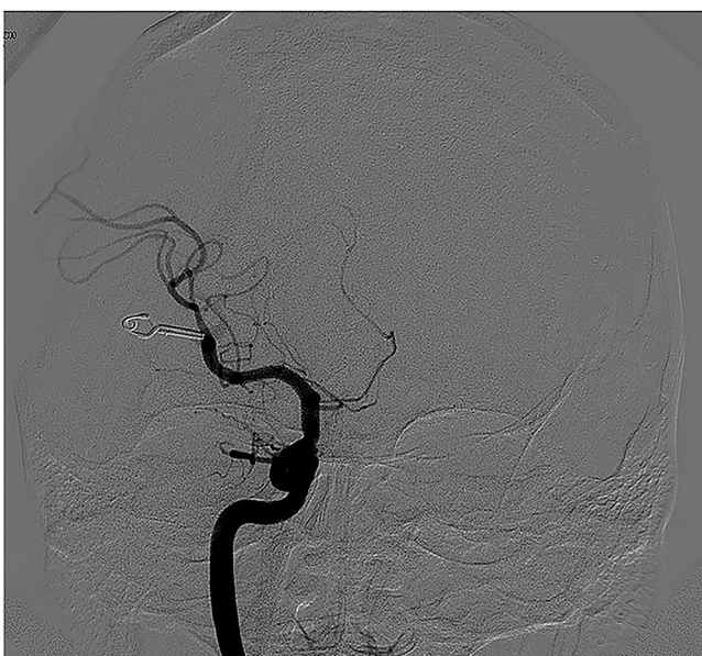
Figure 2. Cerebral Angiography, Coronal View to the Post-operative Scan with the Clipping of the AVM

After surgery, the patient showed a progressive improvement of the pre-operative symptoms. The post-operative examination displayed a complete removal of the lesions, meningioma and AVM (Figures 2-3). The post-operative imaging discovered a neoplastic lesion of the right pulmonary apex whereby he is now following a specific therapeutic procedures.