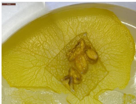
Figure 1: Optical microscope image of Physarum polycephalum on Agar nutrient gel, in this case it is clearly visible that the mould is creating a sort of “pancake-like” structure growing in all directions homogeneously. Thus demonstrating its shape is a function of spatial food distribution.

Therefore, we finally project Physarum done networks on the PANI layer.