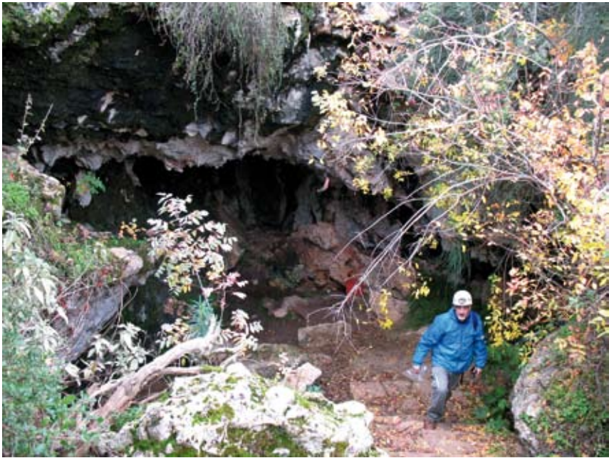
Fig. 11 – Entrance of Gedelma cave.