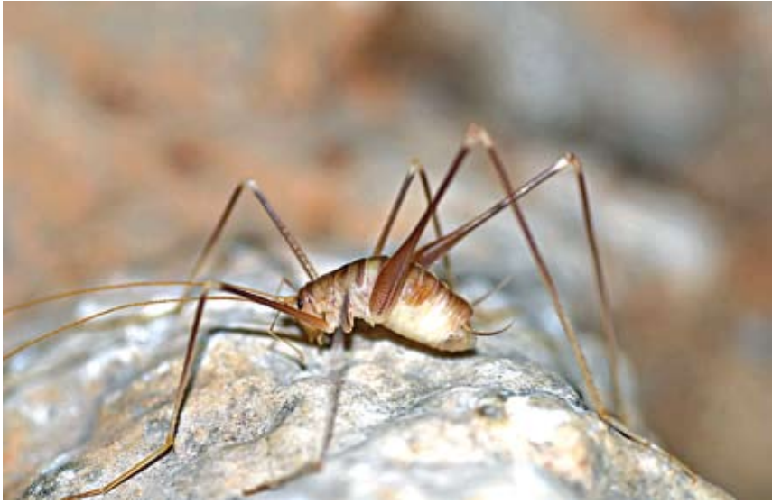
Fig. 10 – Male habitus of Dolichopoda lycia (Photograph: M. Rampini).