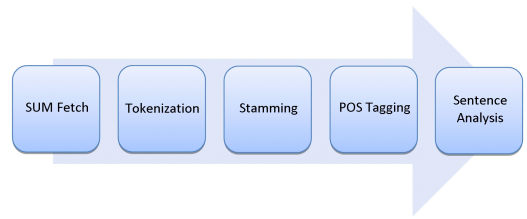
Fig. 3. Text Mining stages applied to an SUM.

The first step of the text mining process is the fetch of the SUM. Then, before performing any operation, the SUM is tokenized. This is a fundamental step that converts each stream of characters into a stream of processing units called tokens. Each token is then converted to a standard form by the process of stemming, that reduces different grammatical word forms