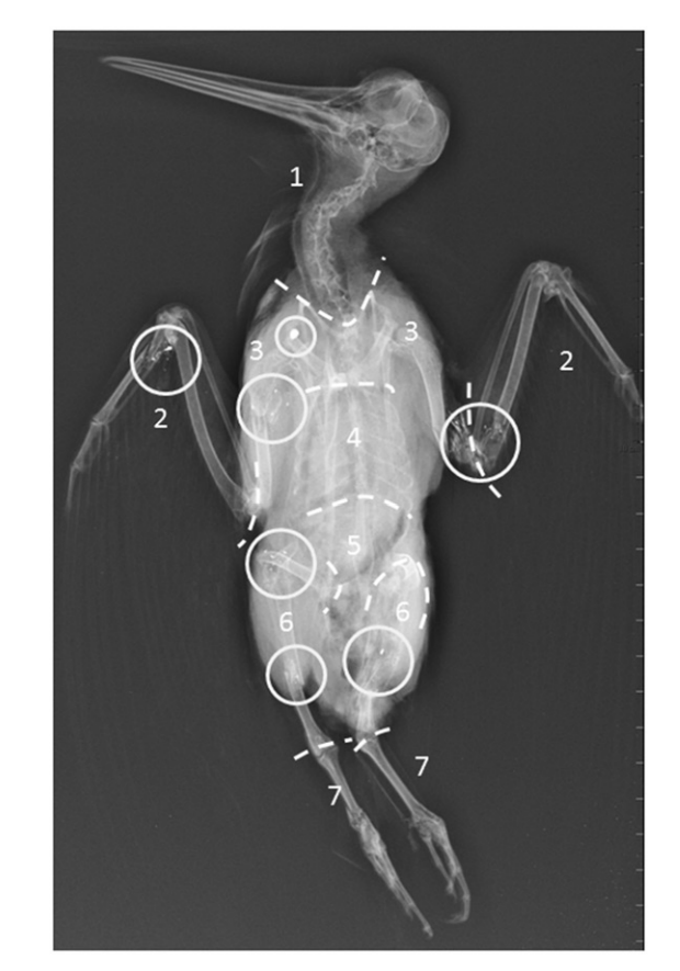
Figure 1. X-ray photograph of a woodcock, showing the body sectors where the position of each shot pellet and fragment was noted. 1, head and neck; 2, wings; 3, humerus and a pectoral girdle; 4, thorax; 5, abdomen; 6, femur and tibiotarsus and 7, tarsus and metatarsus. A whole pellet and six fragmentation centres can be recognised inside the grey circles.

To check the ammunition types used by hunters, we performed a necropsy on 20 woodcock and excised 62 whole pellets (2–4 from each bird). These pellets were accurately washed, dried and weighed by means of a Sartorius analytical balance (accuracy d = 0.1 mg) (A&D Laboratory Balances, Bradford, MA). Furthermore, each pellet was examined for colour, form and size, and tested to see whether they were attracted by a bar magnet.