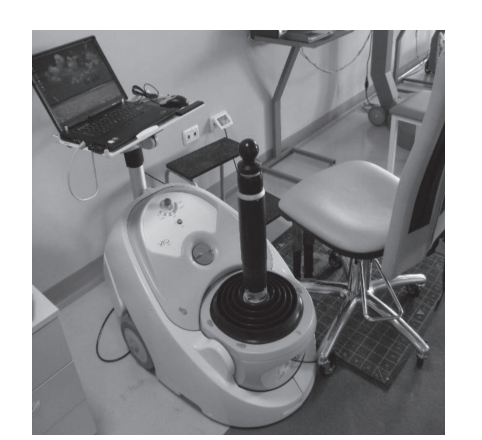
Fig. 1. Robotic system for the upper limbs: ReoGo^{TM} (Motorika Medical Ltd, Israel).

Each patient underwent a cycle of treatment with a robotic system for the upper limbs (ReoGo<sup>TM</sup>; Motorika Medical Ltd, Israel, Fig. 1) (17). This instrument makes it possible to perform a specific treatment for the upper limbs, in particular through the mobilization of the shoulder and elbow joints. The robot makes it possible to execute movements in 3 dimensions and on all spatial planes. The exercises can be performed in various ways: with forearm support, wrist support only, or through a handgrip. Thus, the system makes it possible to perform numerous kinds of exercises, the purpose of which is to reach the objectives on the computer screen connected to it, with visual and audio feedback.