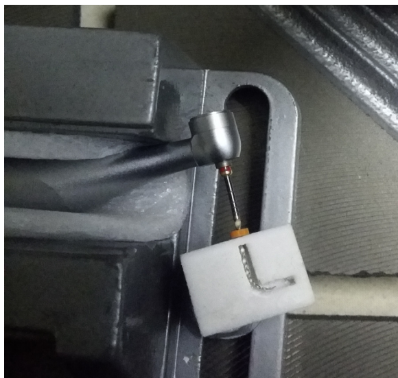
Figure 1 Device created for the cyclic fatigue resistance tests of the rotary instruments.